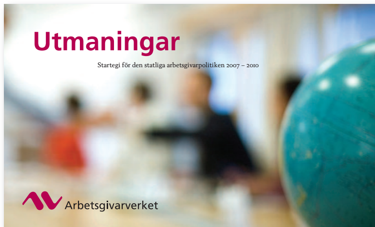
Challenges , Policy strategy for government employers 2007 – 2010 (Swedish Agency for Government Employers)